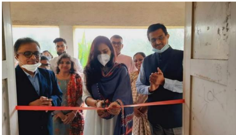
Inauguration and starting of blood donation drive by cutting the ribbons

On 30th December 2021, Volunteers of NSS SAOE conducted blood donation drive in collaboration with NSS of SIBAR. Under the guidance to Program officers of both colleges. Chief Guest Mrs. Navale Mam inaugurated the drive at 10 am by cutting the ribbons. The drive was held in SIBAR College's building in Sinhgad Kondhwa Campus. Students from all the colleges of Sinhgad Kondhwa Campus Volunteered and donated blood. To encourage participation Volunteers made posters & slogan then circulated around the campus. All the blood bags were collected by the Kashibai Nawale Hospital's blood bank. Donars and all the volunteers were given refreshments. Everyone who donated blood was also given a certificate and a present by NSS. The drive and the year were concluded with collection of 200 blood bags.