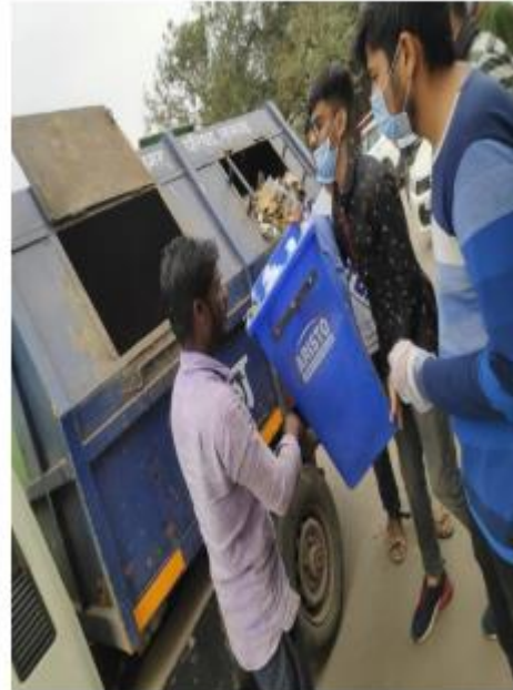
Student Participation in cleanliness drive