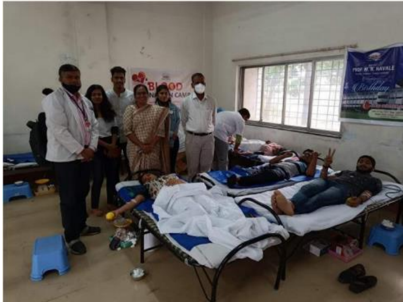
Staff and students while donating blood and checking HB for blood donation