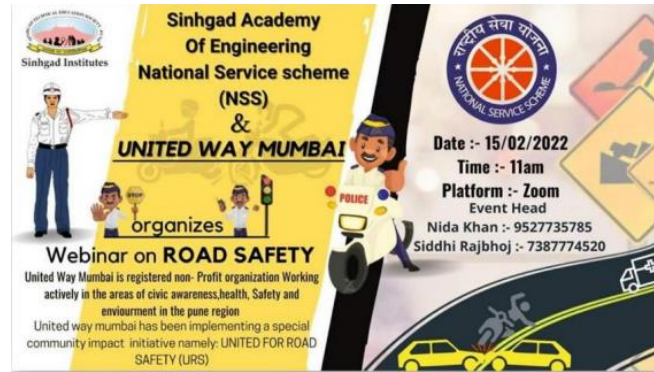
Poster of Road Safety Webinar for Promotion

explained about road safety signs, printed symbol or lines on road surface, which type of helmets should be use by rider & pillion etc and in the end of session they cleared all doubts of participant and provided the link for feedback, after submission of feedback form participate got the certificate of participation.